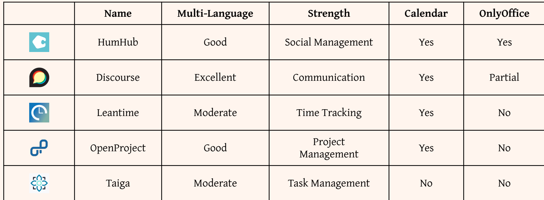
Table of Comparison